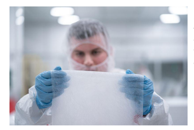
Fig. 1 The nonwovens used for FFP-2 masks must filter at least 94 percent of aerosols, particles or viruses according to DIN.

The Fraunhofer researchers' plans for the application of this method extend far beyond masks and air filters. Their technology is generally applicable to the production of nonwovens — for example, it can also be used in materials for the filtration of liquids. Furthermore, ProQuIV methods can be used to optimize the manufacture of nonwovens used in sound-insulating applications.