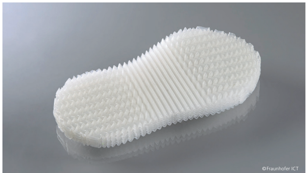
The Future of Materials: Product Design of a Plastic Sole Made of Programmable Material

In the case of “programmable materials”, it is the internal structure that is important; through it, properties can be specifically controlled and the material behavior can change reversibly. Internally, they consist of a three-dimensional arrangement of many small individual cells. These serve as basic elements, are also called unit cells, and assemble them to